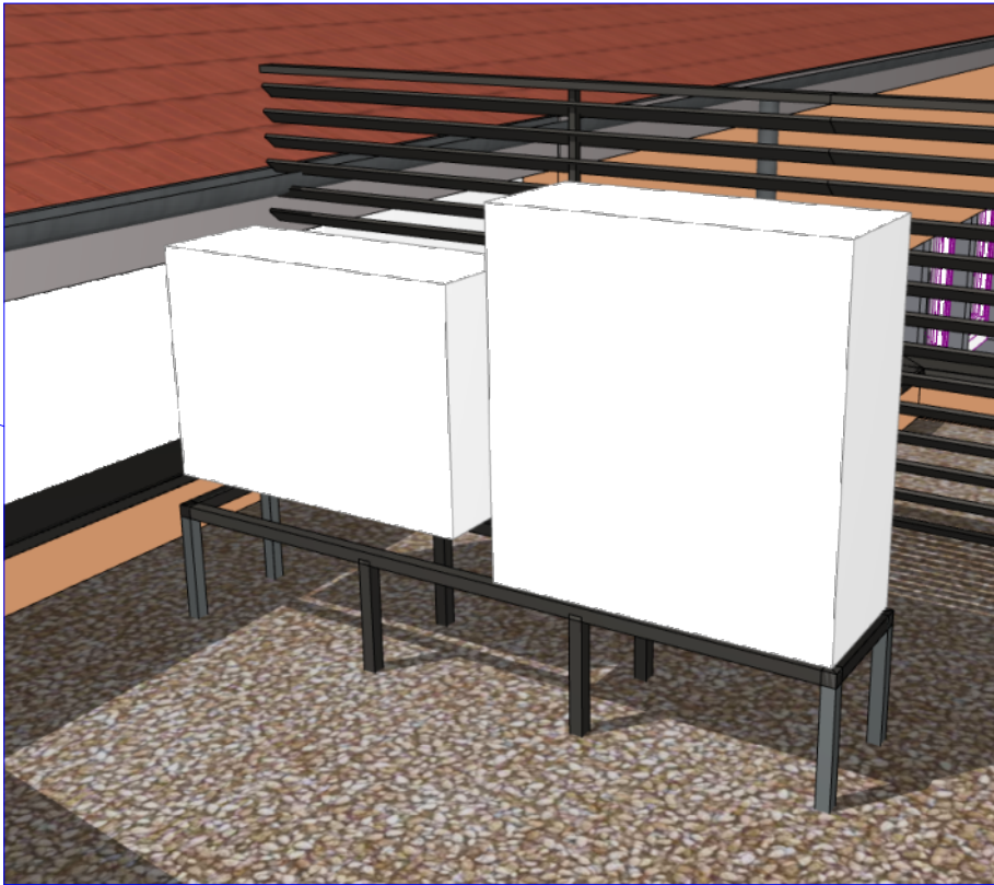
Principe support Onduleur et Groupe clim